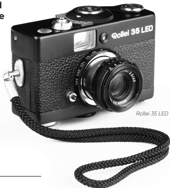
Rollei 35 LED

One such company was Rollei – its production factory in Singapore made flash guns, projectors, lenses, shutters, and cameras, like the Rollei 35 LED.